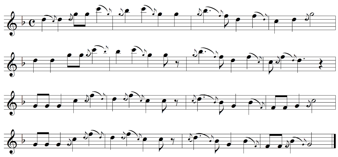
Example 175. La-pentatonic Mountain Cheremis tune (VIKÁR 1993: Cheremis-8)

2) The Mountain Cheremis (about 100,000) live in the south, close to the Volga, in the vicinity of the Chuvash. They are dominated by tunes of four long lines of broadly arched, anhemitonic la - or do -pentatony with tonal fifth-shifting (i.e., within the frames of the tonality). Typical forms are A<sup>8</sup>A<sup>5</sup>A<sup>4</sup>A, A<sup>7</sup>A<sup>5</sup>A<sup>3</sup>A and A<sup>5</sup>A<sup>5</sup>AA. Two-octave ambituses are also possible, so it is not uncommon to have an octave break, even in mid-line. These Cheremis songs seem to be relatively recent and may have developed under Turkic influence ( Ex. 175 ).