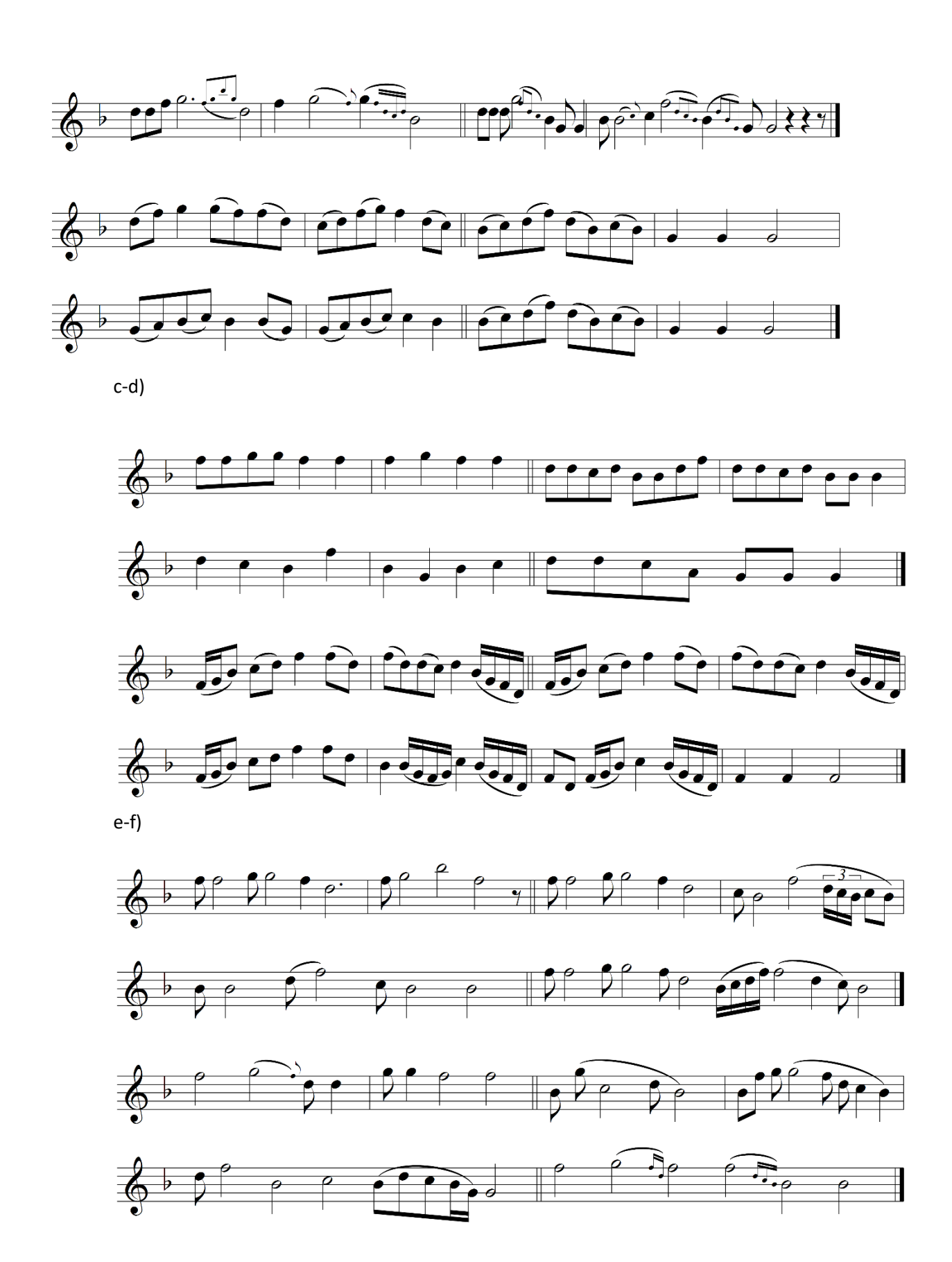
Example 182. Tatar—Bashkir tunes with similarities to Hungarian tunes. a) Ta5-70, b) Ta5-28, c) T0-27, d) Ta5-114, e) Ta5-II-61, f) Ta5-40