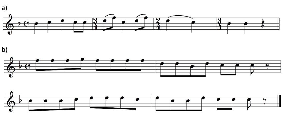
Example 178. Christian Tatar songs. a) old tune style (VIKÁR 1993: Tatar-2), b) historical song (VIKÁR 1979: p. 265, No. 24)

Since the middle of the 17^{th} century, the Tatars and the Bashkirs have also sung historical songs. These songs do not lead into the world of myths, unlike the heroic song, but recount events of the recent past, in tunes of four 7- or 8-syllabic lines. Lines 1-2 and 3-4, resp. belong together, with a musical half-close at the end of line 2. The second half of the melody may be a transposed-varied version of the first line or new music. A line usually consists of two motives (a+a, a+a<sub>v</sub>, a+b). The style of performance is simple, restrained, unadorned syllabic, mostly tempo giusto, sometimes recitative ( Ex.178b ).