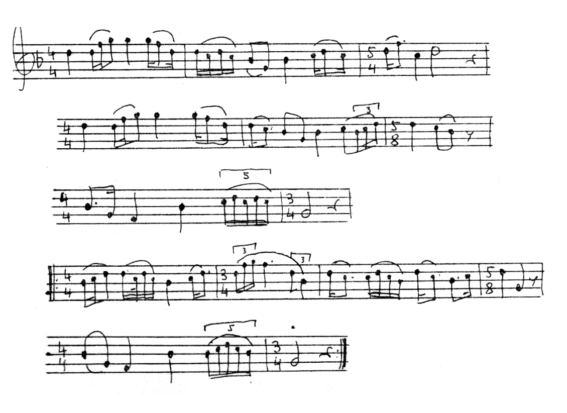
Example 185. Mishar Tatar tune (VIKÁR 1979: p. 260, No. 14)