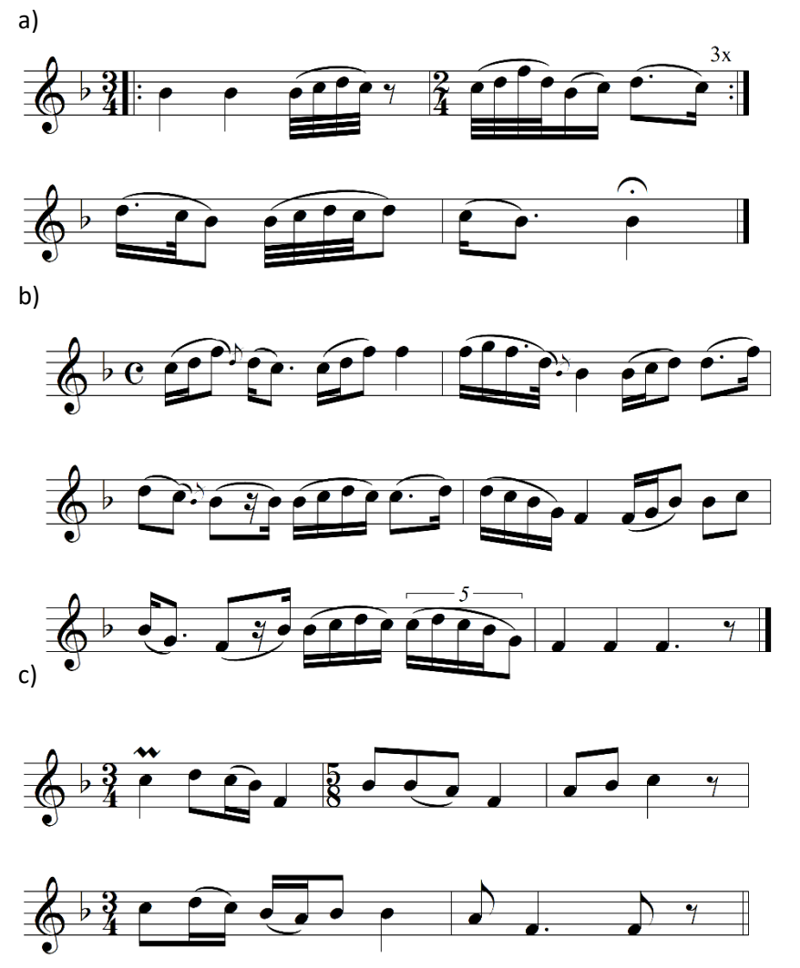
Example 173. Votyak songs a) so'-mi-re-do tetratony (VIKÁR 1993: Votyak-5), b) three-lined so-pentatonic tune with undulating melody outline (VIKÁR 1993: Votyak-8), c) do-re-mi trichord (VIKÁR 1993: Votyak-6)

Example 173b, with its lines undulating up and down on the so'-mi-re-do and then mi-re-do-so tetratony, recalls the characteristic melody motion of the Mongolian Kazakh tunes. Rarely, a semitonal pentatonic scale also occurs ( Ex. 173c ).