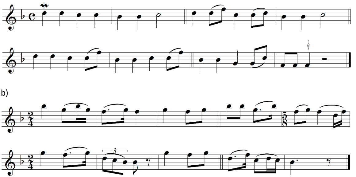
Example 176. Eastern Cheremis tunes a) so-pentatonic song (VIKÁR 1971: 54), b) do-pentatonic song (VIKÁR 1971: 7)