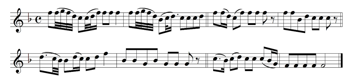
Example 179. Village song (VIKÁR 1993: Tatar-4)

Several villages have their own sparsely ornamented, four-line tunes ( aul küy ) performed in moderate tempo. These tunes are divided into two parts: the second half is below the first, and although there is no fifth-shifting, a partial fourth shift is not uncommon ( Ex. 179 ). This may be explained by the fact that most of the old melodies are built from the so-la-do-re tetratony, which remains within the same pentatonic system a fourth lower [ re-mi-so-la ], while transposed a fifth, fa below do leaves the system.