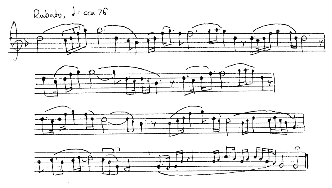
Example 180. Long song (Uyel) (VIKÁR 1979: p. 261, No. 16)

The long songs are longer and more complex than other Bashkir and Tatar melodies, but the overall picture fits into the typical Tatar-Bashkir repertoire. Usually, four lines of roughly equal length make up a melody, but sometimes there are 5-6-7 lines, some shorter and some longer ones. The first half of the tunes start high and then gradually descend. The second half of the melody starts somewhere around mid-range, then rises before reaching the close ( Ex. 180 ). Similar melodies can also be found in the music of other Turkic peoples (for example, Bartók's (1976) Anatolian Song No. 8a).