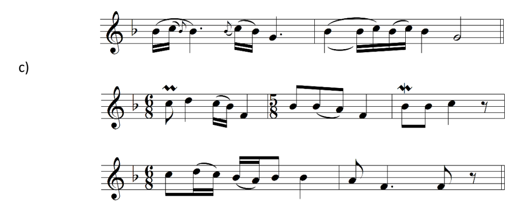
Example 172. Mordvin tunes a) (so)-mi-re-do motive (VIKÁR 1993: Mordvin-1), b) re-do-la motive (VIKÁR 1993: Mordvin-2), c) semitonal so-pentatonic wedding tune (VIKÁR 1993: Mordvin-6)