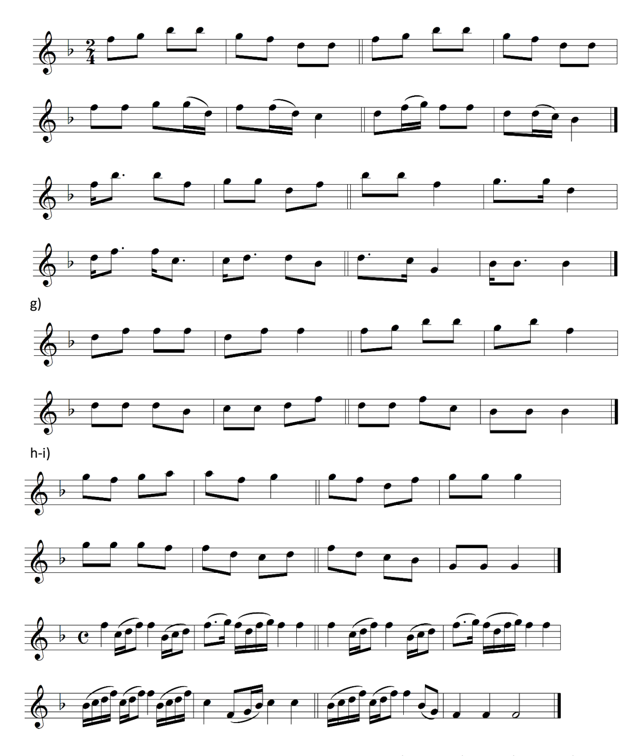
Example 183. Tatar and Bashkir tunes that are similar to Hungarian tunes. a) Ta5-99, b) T0-31, c) Ta5-58, d) Ta5-II-10, e) Ta5-II-56, f) B0-188, g) B0-193, h) Ta5/II-39, i) Ta5-II-8

As for the two-line Tatar—Bashkir melodies, almost all of them are do -pentatonic, the cadences of one or two songs are b3, 4, 5, 11, while the rest have 7, 8, or 10. The higher cadencing tunes are characterized by a disjunct structure and a fourth- or fifth-parallelism between the lines, at least between the important parts of the lines ( Ex. 184 ).