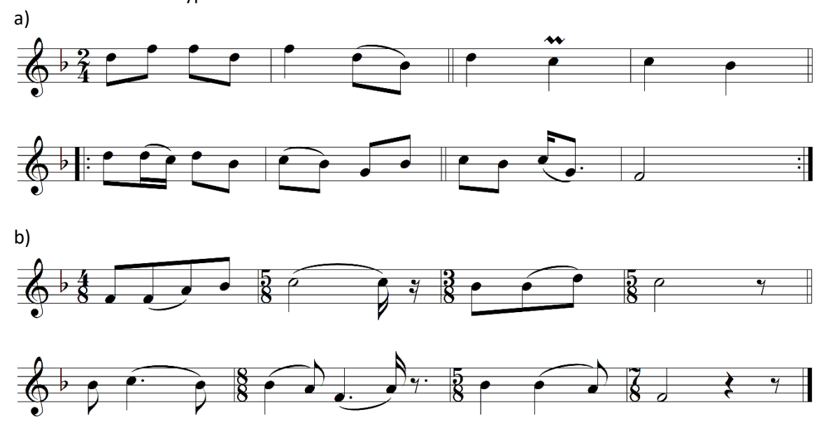
Example 177. Chuvash tunes a) southern three-line form (VικάR 1993: Chuvash-3) b) eastern motivic tune (VικάR 1993: Chuvash-1)

Eastern Chuvash are found in Tatar, Bashkir and West Siberian regions. They sing simple, single- or two-section melodies of 3–4 notes (so,-ti-do-(re)) (see the Sernur Cheremis), with few motives, a stable melodic line but often with varying rhythm (Ex. 177b). Their ornamentation shows Tatar influence. Here, among the southern Chuvash, and also among the Tatars, the A<sup>c</sup>A and the three-line form are typical.