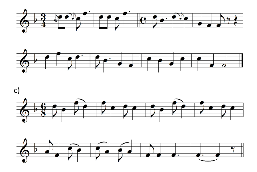
Example 174. Forest Cheremis tunes a) so-pentatonic with real fifth shift (VIKÁR 1993: Cheremis-6), b) A<sup>5</sup>BAB or A<sup>4</sup>BAB small form (VIKÁR 1993: Cheremis-3), c) so-ti-do-re-mi-so semitonal pentatonic northeastern tune (VIKÁR 1993: Cheremis-2)

2) The Mountain Cheremis (about 100,000) live in the south, close to the Volga, in the vicinity of the Chuvash. They are dominated by tunes of four long lines of broadly arched, anhemitonic la - or do -pentatony with tonal fifth-shifting (i.e., within the frames of the tonality). Typical forms are A<sup>8</sup>A<sup>5</sup>A<sup>4</sup>A, A<sup>7</sup>A<sup>5</sup>A<sup>3</sup>A and A<sup>5</sup>A<sup>5</sup>AA. Two-octave ambituses are also possible, so it is not uncommon to have an octave break, even in mid-line. These Cheremis songs seem to be relatively recent and may have developed under Turkic influence ( Ex. 175 ).