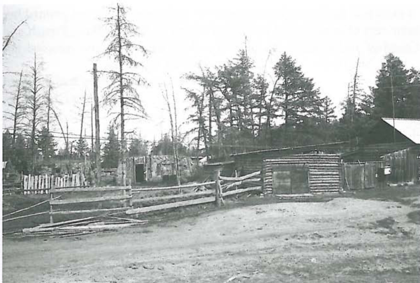
Fig. 1. View of a Sakha homestead in the village of Berjigesteex. Photo: László Kunkovác, 1997.