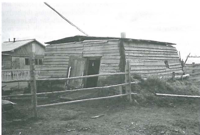
Fig. 2. A Sakha cowshed ( xoton ) in Berjigesteex. Photo: László Kunkovác, 1997.