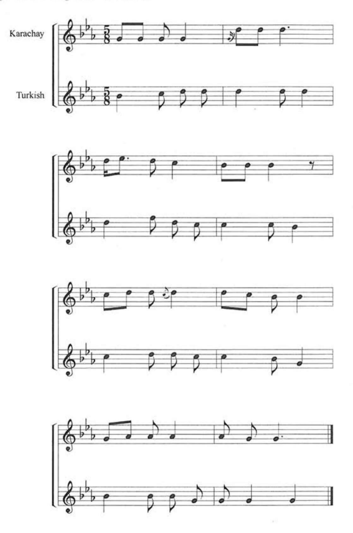
Fig. 3: Karachay zikr melody and its Hungarian counterpart.

characteristics of these melodies are four short and descending sections with cadences on D, B flat, B flat, and G (Fig. 3). This melody form is widespread in the folk music of different Turkic people (SIPOS 2006: 311–319); probably an important layer of the Karachay folk music survives here in the guise of religious melodies.