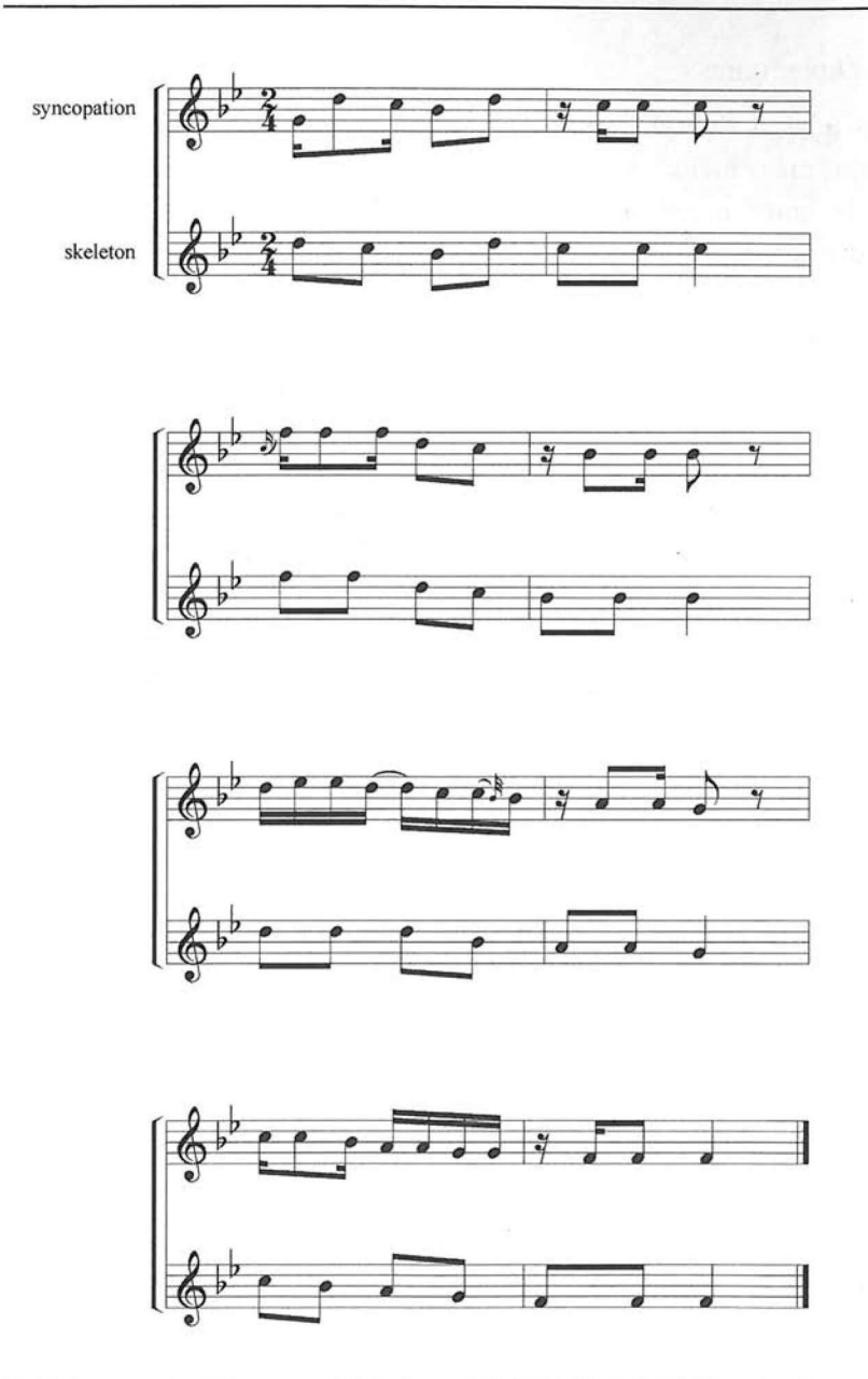
Fig. 6: An example of the syncopated performance, characteristic to the Karachay dance songs.