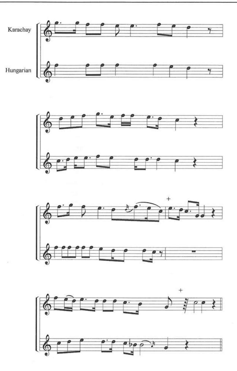
Fig. 7: Melodies with downward extension a) Karachay lament form Turkey, b) A Hungarian lament.