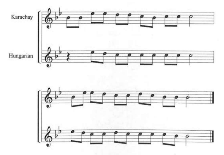
Fig. 2: The skeleton of two-sectioned laments a) Karachay lament from Turkey, b) Hungarian lament.

The Karachays in Turkey do not sing laments at all; not even the oldest people remember if they had ever heard one. This is all the more interesting because the musical forms of the laments are usually very stable and often they are effectively resistant to change. We know that in some Turkic cultures there are connections between the musical forms of the lament and those of the lullaby (Sipos 1994, 2000). And though we could not find laments, Karachay women do sing lullabies. In Fig. 2 we show a Karachay lullaby which is similar to the simplest tripodic Anatolian and Hungarian laments with its small-range sections descending to D or C.