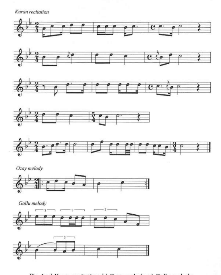
Fig. 1: a) Koran recitation, b) Ozay melody, c) Gollu melody.

Similarly to the Azeri, Anatolian or the Kazakh situation (SIPOS 2000, 2001, 2004a, 2004b, 2010), the Koran is often recited on the B flat-D-C trichord and closes on C (Fig.1a). Similar musical forms can be seen in the children's songs of several people, but not in those of the Karachay. Though the Ozay and Gollu melodies of the primitive faith (SIPOS-TAVKUL 2012: 74) are plagal and are closing on C instead of turning up and down on a trichord, their characteristic melodic movement is a sinking down