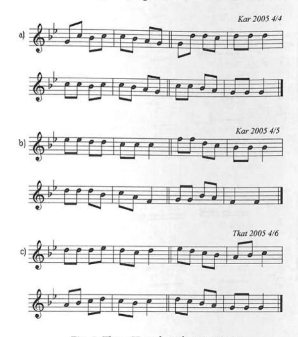
Fig. 5: Three Karachay dance songs.

Dance tunes usually change easily, so it is no wonder that this musical layer contains many melodies arriving from the former Soviet Union. However, in this quite heterogeneous repertoire there are several traditional melodies known and played by everybody. These melodies seem so deeply embedded in the Karachay musical sensitivity, that they could successfully survive newer waves and styles (Fig. 5). I would like to draw the attention